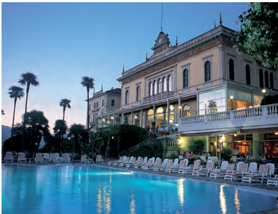
Villa Serbelloni, Bellagio

On the shores of Lake Geneva with stunning view of the Alps, this hotel comprises of five different buildings surrounding the main Reception. The hotel offers contemporary style in a historic setting with parts of the buildings dating back to the 18th century. The 75 bedrooms and Junior Suites are scattered between four buildings, each with their own distinct styles, but all guests will benefit from the same high standards of care from the friendly, professional staff.