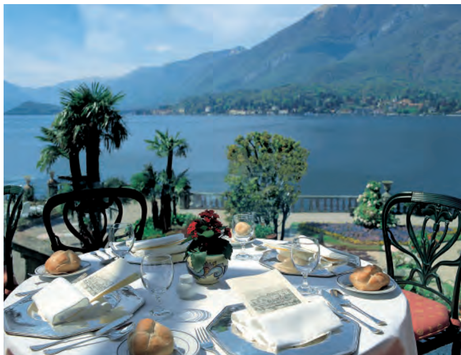
Villa Serbelloni, Bellagio