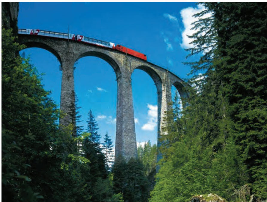
The Bernina Express

In this rail holiday to the Italian Lakes, you take in some of the most spectacular scenery of the Swiss Alps viewed through the panoramic windows of the Bernina Express. Your train journey starts out from the UK by Eurostar to Paris where you change to a high speed TGV train to Zurich. Following a night or more in Zurich, you travel onwards to Chur for another night. Then, board the famous Bernina Express through the very heart of the Alps. The four hour journey on the Bernina Express from Chur to Tirano is truly spectacular. The train travels mostly at low speeds giving time to take in the snowy mountains, pine forests, pretty villages and mountain lakes. The line crosses 196 bridges and 55 tunnels. At its highest point at Ospizio Bernina, the route reaches 2,253 metres before dropping 1,800 metres down to Tirano on the Italian border. In Tirano there is time for lunch before taking an onward local train to Lecco on Lake Como. This is an attractive route, at first passing vineyards perched precariously on hillside terraces, and then travelling along the eastern edge of Lake Como. At Lecco, you will be met at the station and taken by a private driver to Bellagio and your hotel.